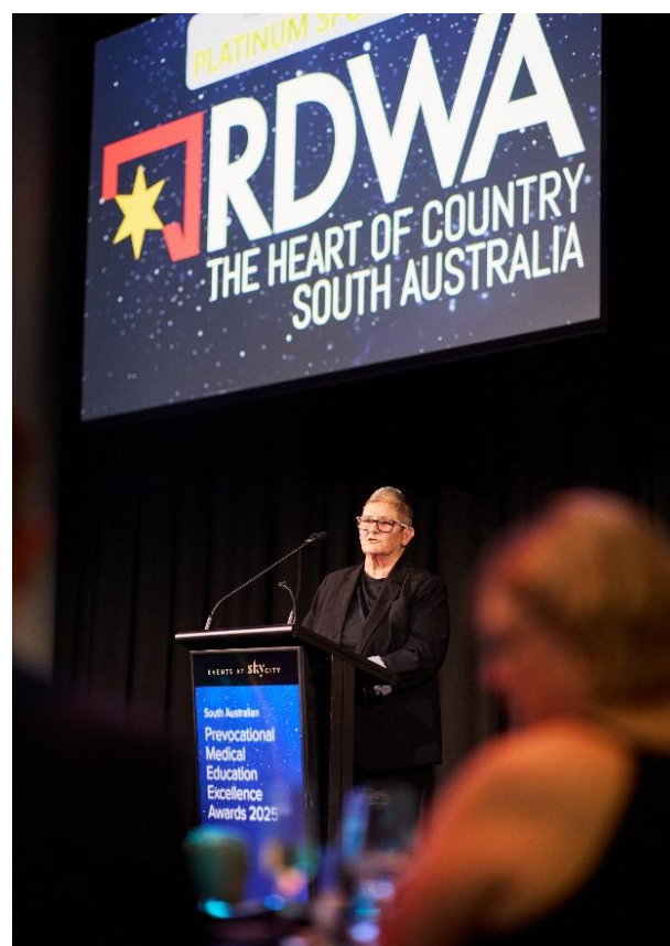
2025 SA Prevocational Medical Education Excellence Awards Platinum sponsor presentation