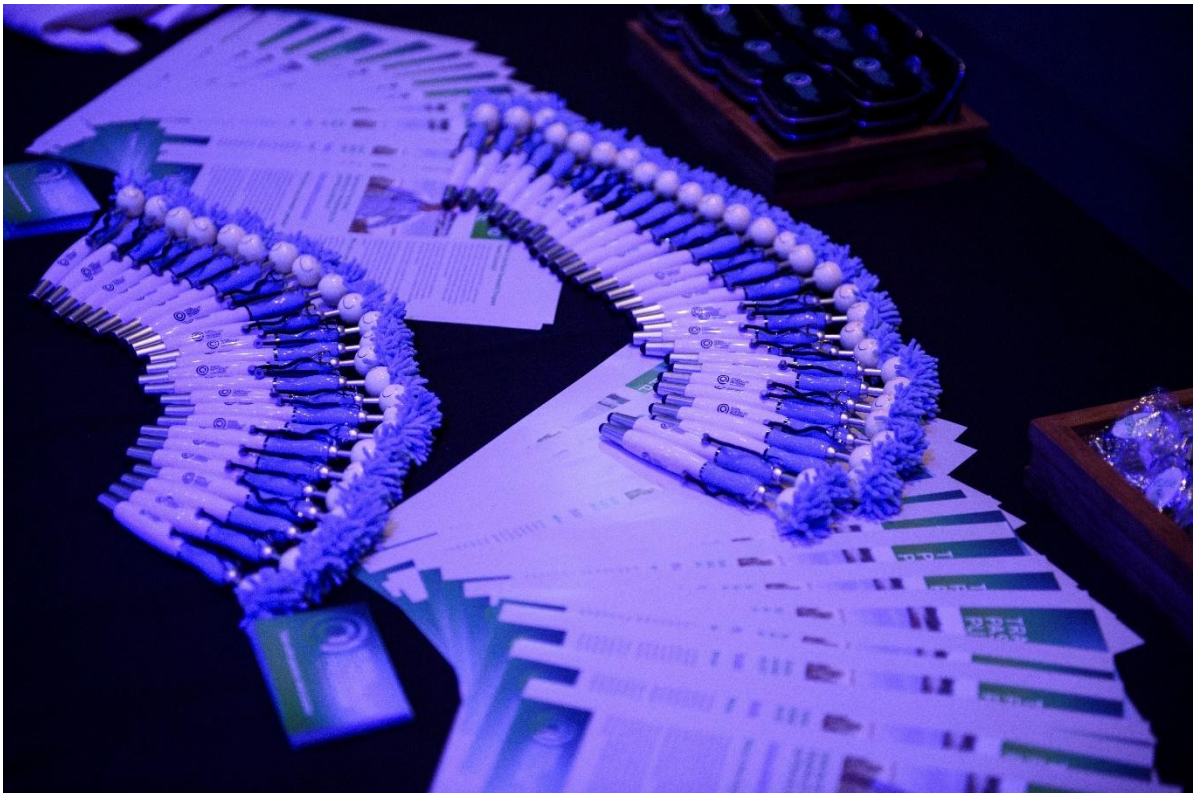
2024 SA Prevocational Medical Education Excellence Awards sponsorship table