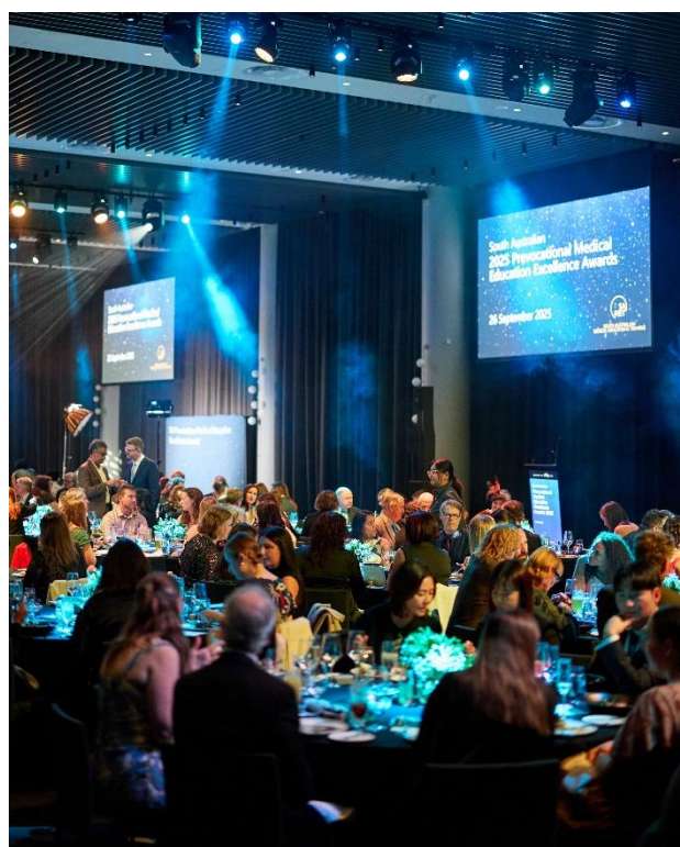
2025 SA Prevocational Medical Education Excellence Awards