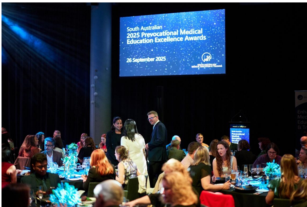
2025 SA Prevocational Medical Education Excellence Awards dinner

* With consent from the sponsor recipient