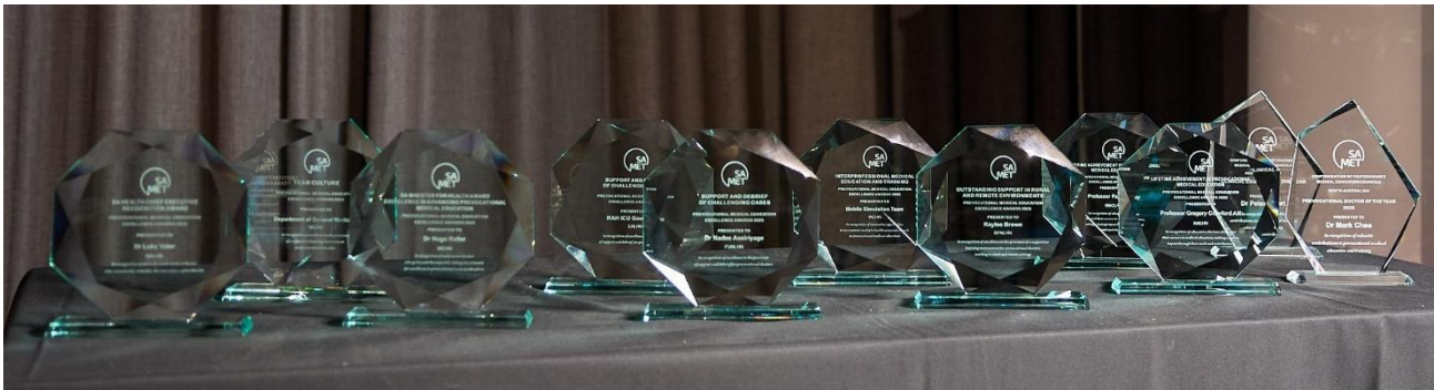
2025 SA Prevocational Medical Education Excellence Awards Trophies