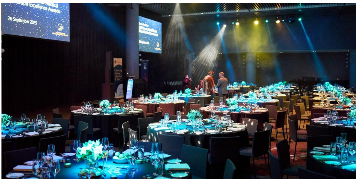
2025 SA Prevocational Medical Education Excellence Awards dinner

Can't see something that suits you or have new ideas on how you can contribute? We can offer flexible, tailored sponsorship opportunities and are happy to negotiate a sponsorship package to suit your needs. Please contact us at healthSAMET@sa.gov.au .