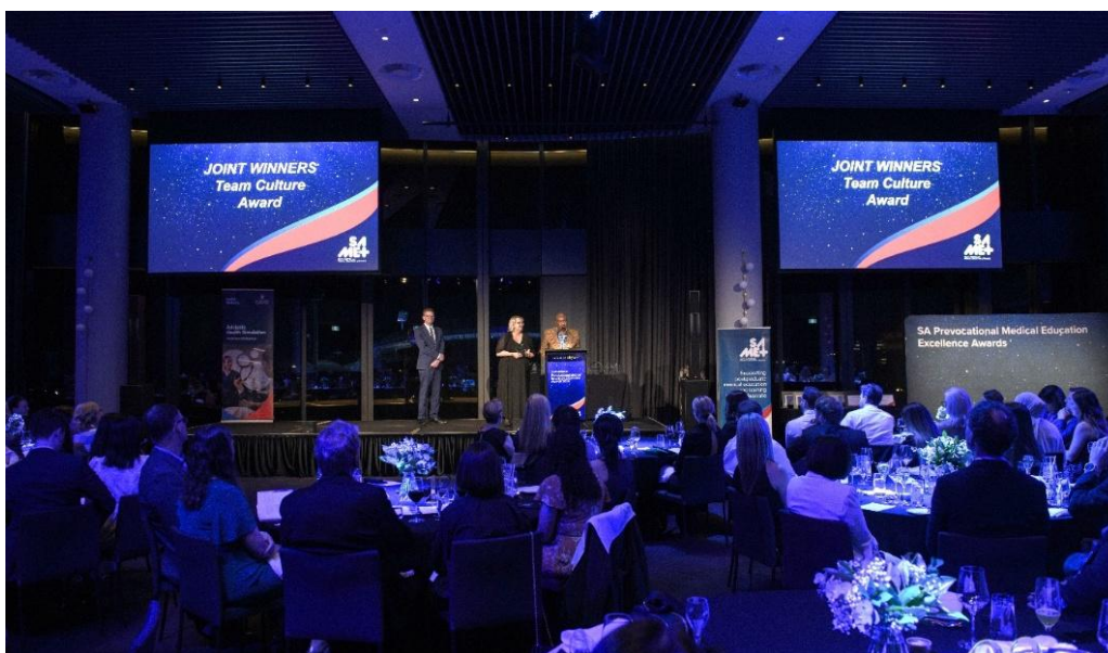
2024 SA Prevocational Medical Education Excellence Awards, Team Culture Award joint winners