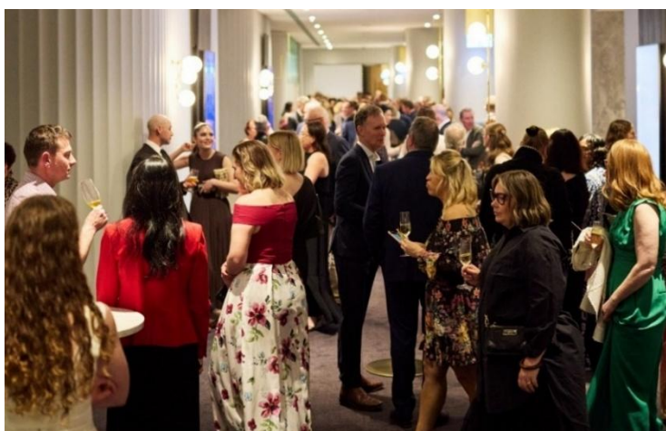
2025 SA Prevocational Medical Education Excellence Awards pre-dinner networking space